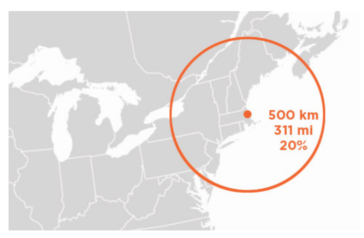
This map shows the area included within 500km (311mi) of the XICO factory in Woburn, MA.

For the Responsible Materials Imperitive (I12) and Living Economy Sourcing (I15), 20% or more of the materials construction budget must come from within 500 kilometers of the construction site.