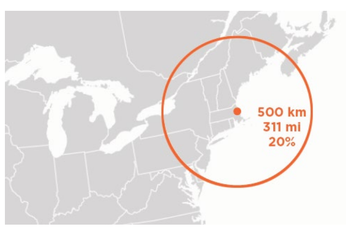
This map shows the area included within 500km (311mi) of the XICO factory in Woburn, MA.

For the Responsible Materials Imperitive (I12) and Living Economy Sourcing (I15), 20% or more of the materials construction budget must come from within 500 kilometers of the construction site.